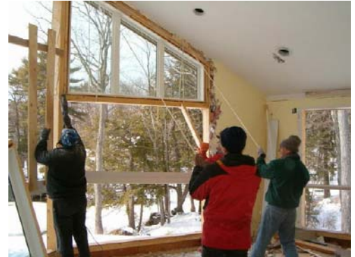
Habitat volunteers removing a trapezoid window from a house on Black Cat Island.

There will be a garage sale of building materials on June 18, 8:00 AM to 3:00 PM for those interested in buying quality used items.