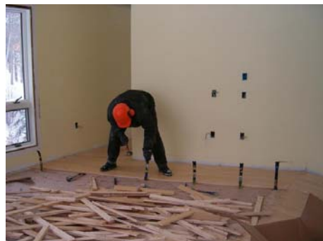
Here a person from the Restorative Justice program is removing Maple flooring.