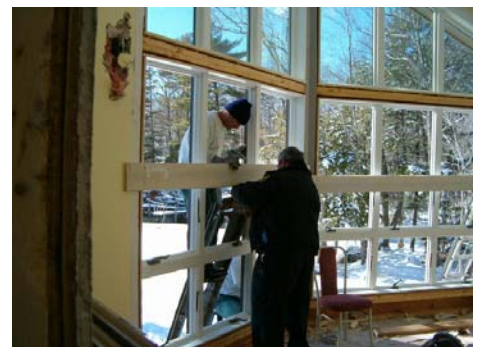
Two prisoners from the NH Correctional Facility in Laconia work to remove a 3-lite casement window.