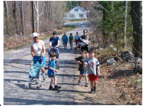
Two LR Habitat board members and a former board member participate. There were two little ones making their first walk-a-thon. This year they can do it in strollers.

This 5-mile walk is a project in partnership with the Guildford United Methodist Church which does the work to get permits, provide drinks along the way, and have refreshments for walkers at the end. One tradition is for each walker to ring the church bell when they complete the walk.