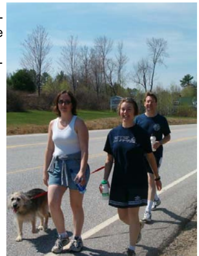
The Walk-a-thon is a family affair. We had walkers in strollers and people in their 80's.

Corporate sponsors will be recognized at the walk and in the next newsletter.