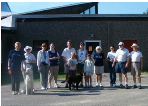
Part of the group from the Center Harbor Congregational Church, UCC, just before setting out on the 5 mile walk-a-thon.