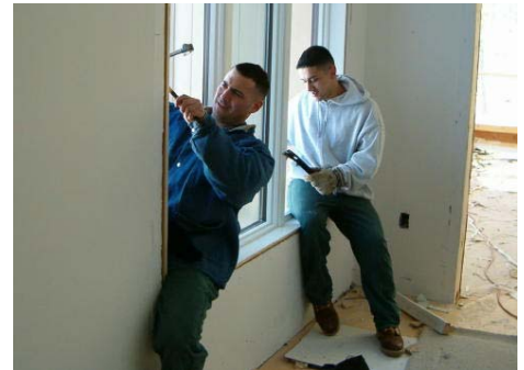
Two prisoners removing the trim around the windows prior to removal.